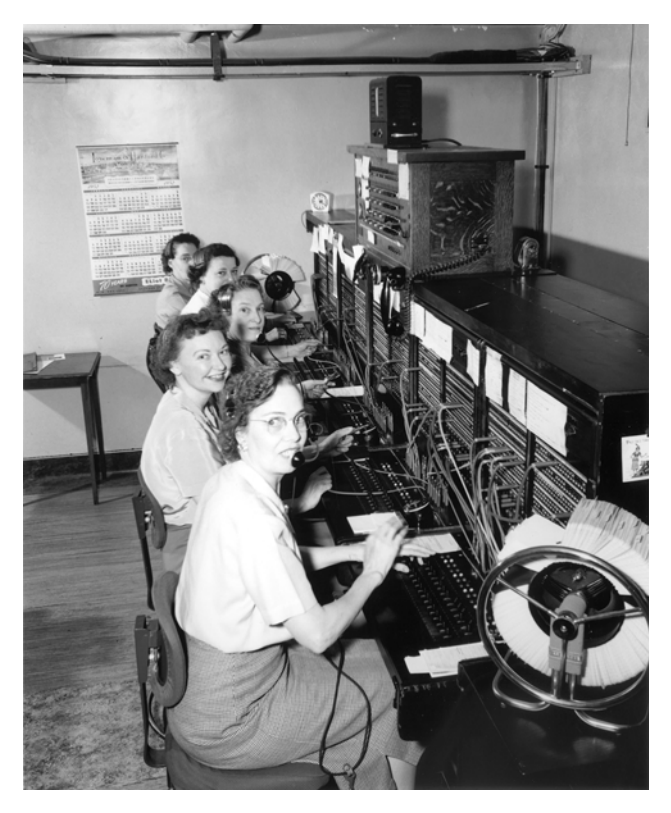
FIGURE 2. Telephone operators, Seattle, Washington, 1952.

Women's and girls' participation in some areas of American popular music in the 1950s and '60s—for example, their roles as music fans and girl-group vocalists—has been well documented. But their interest in the RCA synthesizer is part of another, less well-elaborated historical trajectory: that of women and girls interested in audio technologies, electronics tinkering, and music production. Indeed, women could have been a logical market for synthesizers beginning in the 1950s, in that the technology and associated techniques of the synthesizer patch, the configuration of wires that assemble component elements of a sound into one signal, was inherited from telephone operating—a profession thoroughly associated with women as a labor force and in popular culture (fig. 2). As John Durham Peters writes: "The female body hidden at the heart of a national communications network . . . is an archetypal figure. In popular culture the [telephone] operator was often treated as a heroine who, knowing